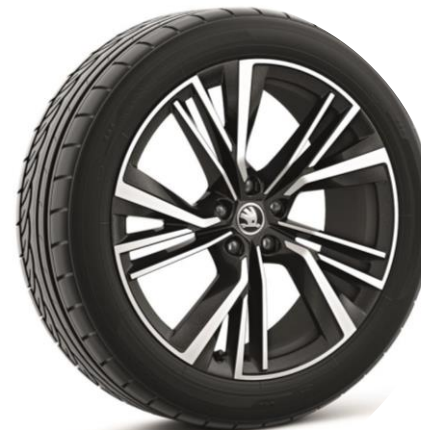
20" 'Neptune' alloy wheels (Code PCC / PCE)