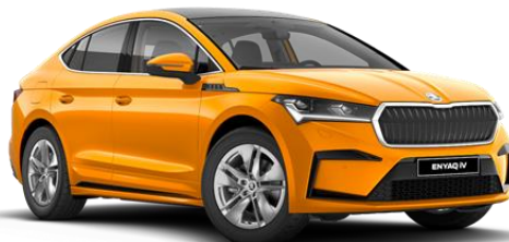
Phoenix Orange (2X2X – Exclusive)