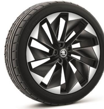
21" 'Supernova' black alloy wheels (Code PJT / PJU)