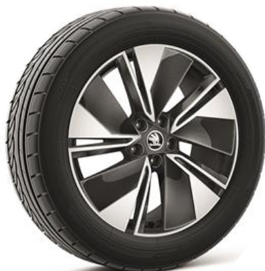
19" 'Regulus' alloy wheels (Code PJA / PJB)