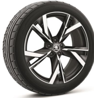
20" 'Taurus' anthracite alloy wheels (Code PJD / PJI)