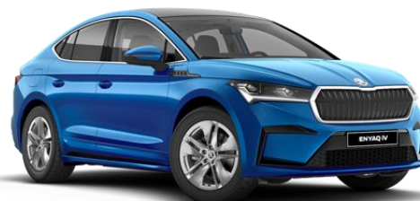
Race Blue (8X8X – Metallic)