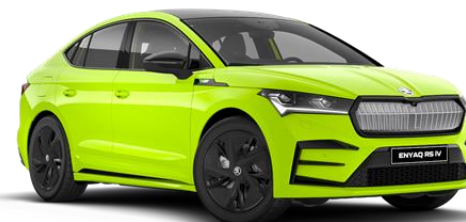
*Mamba Green (I3I3 – Solid)