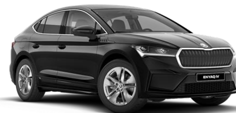
Black Magic (1Z1Z – Metallic)