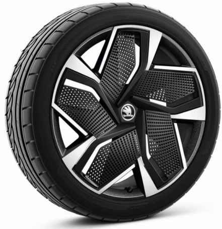
21" 'Vision' anthracite alloy wheels (Code PJS)