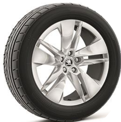
19" 'Proteus' alloy wheels (Code U60)