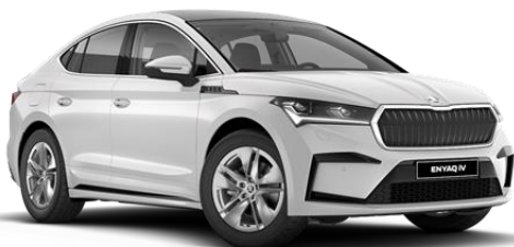
Moon White (2Y2Y – Metallic)