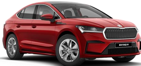
Velvet Red (K1K1 – Exclusive)