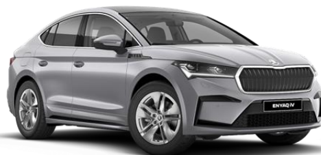
Brilliant Silver (8E8E – Metallic)