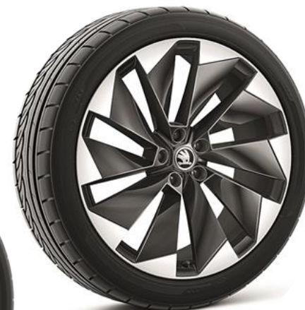
21" 'Supernova' alloy wheels (Code PJF / PJL)