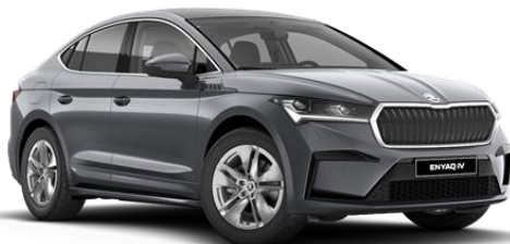
Graphite Grey (5X5X – Metallic)