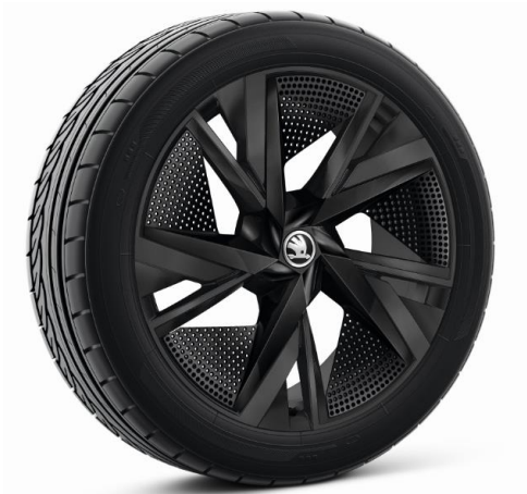
20" 'Taurus' black metallic alloy wheels (Code 55K)