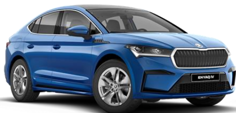
Energy Blue (K4K4 – Solid)