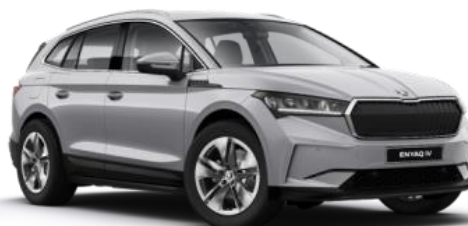
Brilliant Silver (8E8E – Metallic)