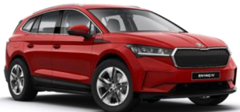
Velvet Red (K1K1 – Exclusive)