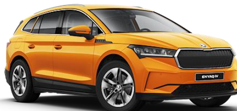
Phoenix Orange (2X2X – Exclusive)