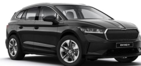
Black Magic (1Z1Z – Metallic)