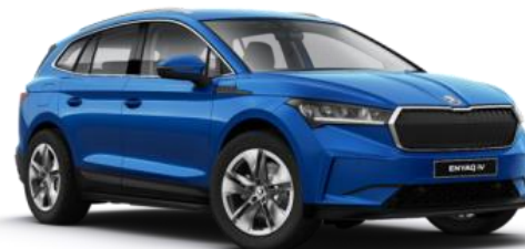
Race Blue (8X8X – Metallic)