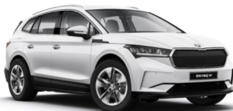
Moon White (2Y2Y – Metallic)