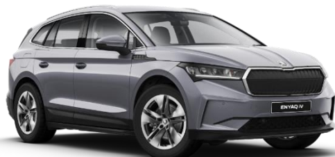
Graphite Grey (5X5X – Metallic)