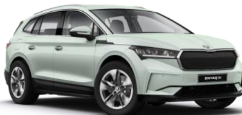
Artic Silver (H6H6 – Metallic)