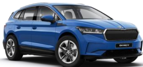
Energy Blue (K4K4 – Solid)