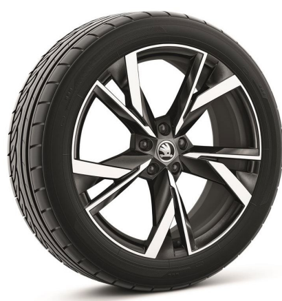
20" 'Taurus' anthracite alloy wheels (Code PJD / PJI)