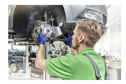
Brake Pads may require replacement during the Service Interval or if the vehicle signals the driver on the infotainment display.