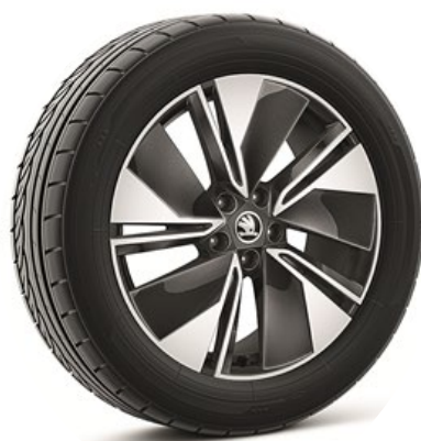
19" 'Regulus' alloy wheels (Code PJA / PJB)