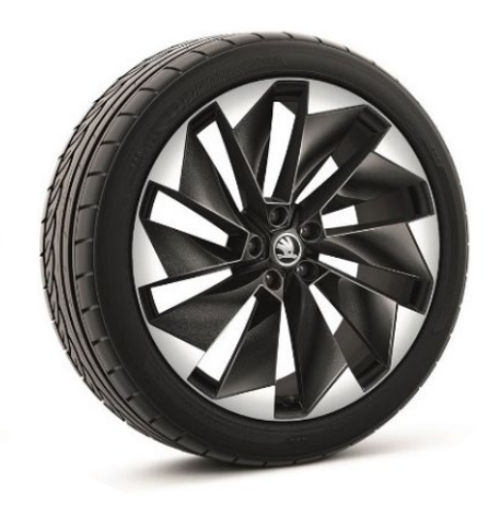
21" 'Supernova' black alloy wheels (Code PJT / PJU)