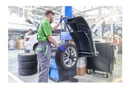
4 Low Rolling Resistance Tyres provide better battery range and low cabin noise levels. They are likely to be the most expensive operating cost you will experience during the lifetime of the vehicle.