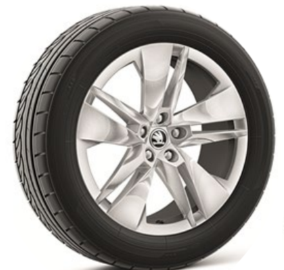
19" 'Proteus' alloy wheels (Code U60)