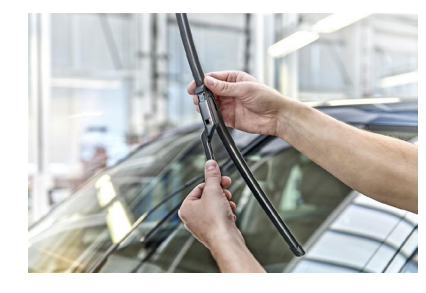
Wiper Blades ensure maximum visibility and safety. A set of wiper blades is included in the Tyre & Maintenance Plan.

Tyre and Maintenance Plan Summary: Replacement Tyres - As required €1,240, Mode 2 Charging Cable for backup/domestic charging (supplied at delivery) -€274, Inspection 1 & 2 - Electronic Vehicle Health Check, Functionality and Fault Assessment -€70, Routine Service Maintenance - High Voltage Component Check, Running Gear Assessment, High Voltage Battery Status, Brake Fluid Change, Pollen Filter Replacement, Top-up Cooling System Levels- €209, Brake Pad Replacement - As required-€175, Wiper Blade Replacement - As required -€96. Total value if purchased separately €2,064. As part of Tyre and Maintenance Plan €1,250 (saving of 39%). Price based on component recommended retail price and average dealer labour rates. Tyre prices are based on 21" Self Sealing Technology. Please discuss your Tyre & Maintenance Plan requirements with your local ŠKODA Dealer.