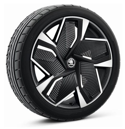
21" 'Vision' anthracite alloy wheels (Code PJS)