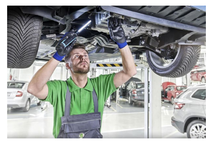
Service Interval Maintenance High voltage component checks, Brake Fluid Change, Pollen Filter Replacement and a Coolant refill are the main tasks carried out by technicians during this service.