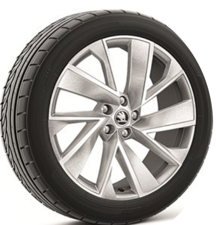
20" 'Vega' alloy wheels (Code PCA / PCD)