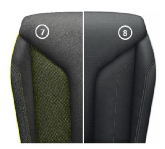
Option prices quoted are for reference only and are subject to change depending on VRT band applicable - please contact your local ŠKODA dealer for more information.