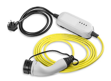
3 Pin Home Charging Cable Is essential when charging away from home or when public charging points cannot be accessed.

The new ŠKODA ENYAQ IV uses the latest materials and technologies that requires expert skills and knowledge when it comes to maintenance and care. For your convenience we have compiled a Tyre & Maintenance Plan as part of the vehicle delivery charge to provide up to 39% savings when compared to purchasing the services and components separately. See below for what is included in the ENYAQ IV Tyre & Maintenance Plan.