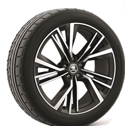
21" 'Supernova' alloy wheels (Code PJF / PJL)