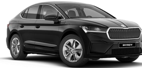
Black Magic (1Z1Z – Metallic)