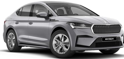
Brilliant Silver (8E8E – Metallic)