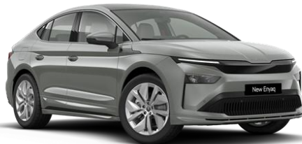
Steel Gray (M3M3 – Solid)