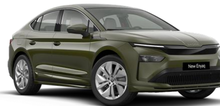
Olibo Green (R2R2 – Exclusive)