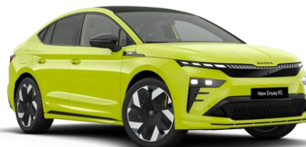
Mamba Green I3I3 – Solid)