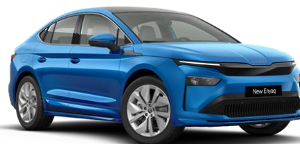
Race Blue (8X8X - Metallic)