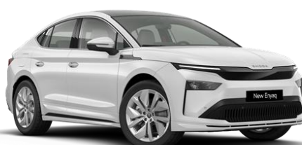
Moon White (2Y2Y – Metallic)