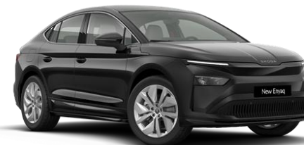
Black Magic (1Z1Z – Metallic)