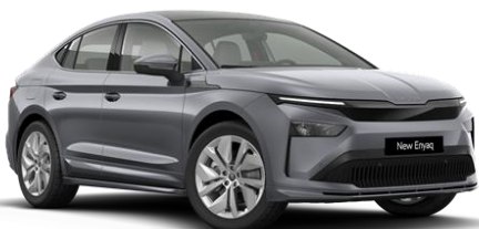
Graphite Grey (5X5X – Metallic)