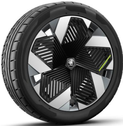
20" 'Vega' silver alloy wheels (Code U20/65R) 21" 'Supernova' anthracite alloy wheels (Code PJG/PJH) 20" 'Vega' anthracite alloy wheels (Code CB2) 21" 'Supernova' black alloy wheels (Code PJJ/PJM) 21" 'Vision' alloy wheels (Code 65Z)