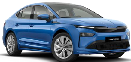
Energy Blue (K4K4 – Solid)