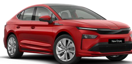
Velvet Red (K1K1 – Exclusive)