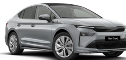
Smokey Diamond Silver (B3B3 – Metallic)