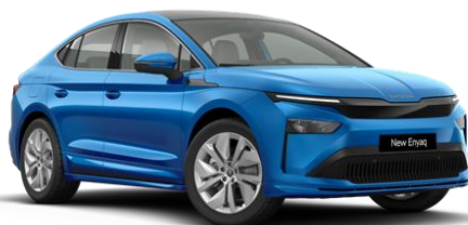
Race Blue (8X8X – Metallic)