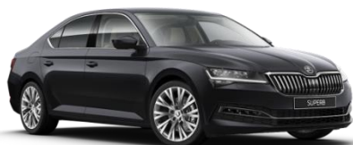
Crystal Black^ (6J6J – Exclusive)