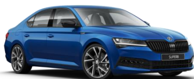
Race Blue^ (8X8X – Metallic)