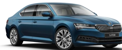
Lava Blue (0F0F – Metallic)