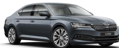
Quartz Grey^ (F6F6 – Metallic)