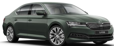
Emerald Green (2A2A – Metallic)