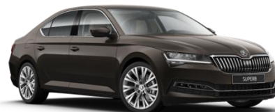
Magentic Brown (0J0J – Metallic)