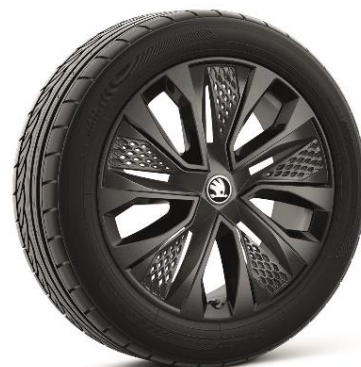
18" Procyon Black incl. black aero inserts (Code C3I)