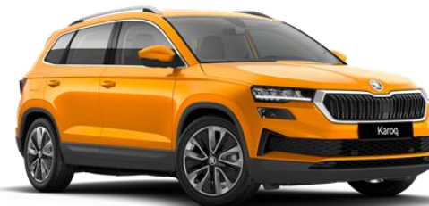
Phoenix Orange (2X2X – Exclusive)