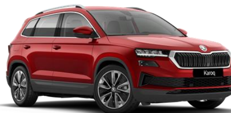
Velvet Red (K1K1 – Exclusive)