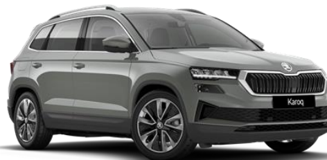
Steel Grey (M3M3 – Solid)