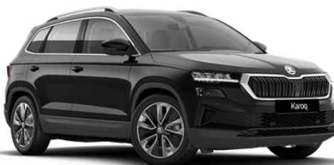
Black Magic (1Z1Z – Metallic)