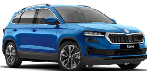
Race Blue (8X8X – Metallic)