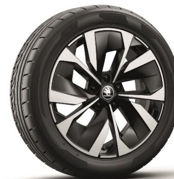
18" Miran Black aero alloy (Code PV3)