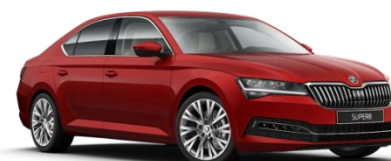
Velvet Red^ (K1K1 – Exclusive)