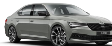
Steel Grey^ (M3M3 – Solid)