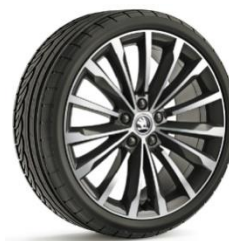
19" 'Trinity Anthracite' alloy wheels (Code PJ8)