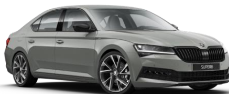
^Steel Grey (M3M3 – Solid)