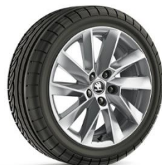
17" 'Stratos' alloy wheels (Code PX2)