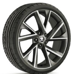
19" 'Vega' alloy wheels (Code PJU)