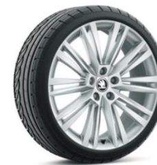
19" 'Canopus' alloy wheels (Code PCE)