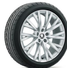
18" 'Antares' alloy wheels (Code PXB)