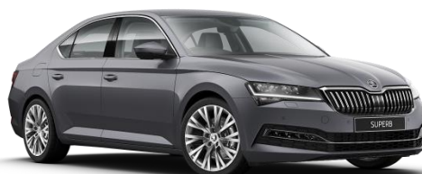
^Graphite Grey (5X5X – Metallic)