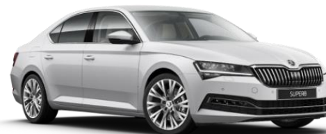
^Moon White (2Y2Y – Metallic)