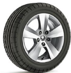
16" 'Orion' alloy wheels (Code PX0)