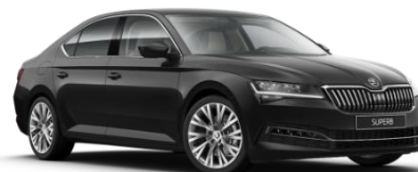
^Black Magic (1Z1Z – Metallic)