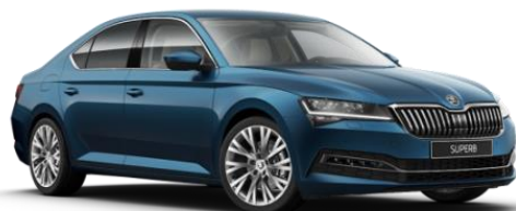
Lava Blue (0F0F – Metallic)