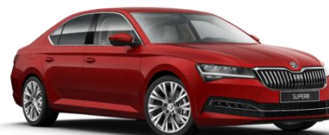
^Velvet Red (K1K1 – Exclusive)