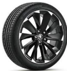
19" 'Supernova' alloy wheels (Code PJZ)