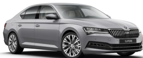
^Brilliant Silver (8E8E – Metallic)