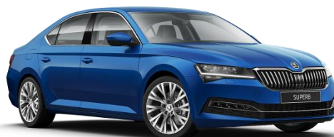
^Race Blue (8X8X – Metallic)