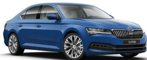
Energy Blue (K4K4 – Solid)