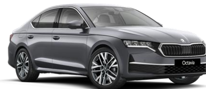
Graphite Grey (5X5X – Metallic)