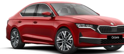
Velvet Red (K1K1 – Exclusive)