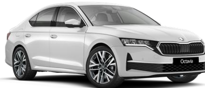
Moon White (2Y2Y – Metallic)