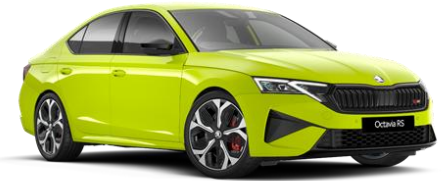
Mamba Green (9P9P – Solid)