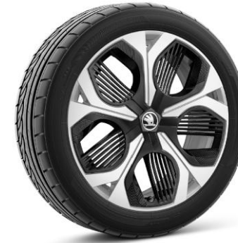
19" Elias silver alloy wheels (Code PJK)