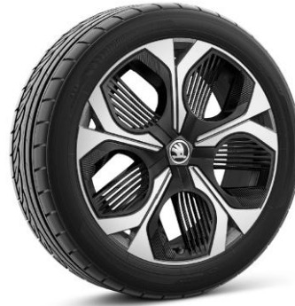
19" Elias anthracite alloy wheels (Code 60L)