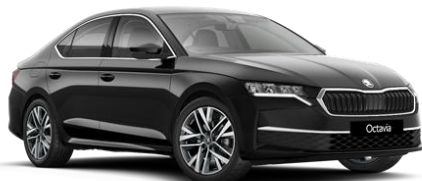
Black Magic (1Z1Z – Metallic)