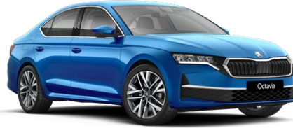
Race Blue (8X8X – Metallic)