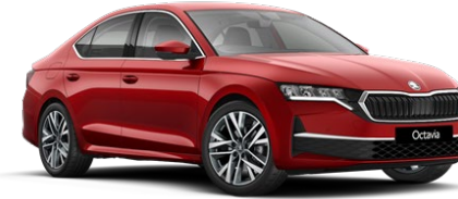
Velvet Red (K1K1 – Exclusive)