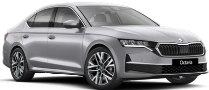
Brilliant Silver (8E8E – Metallic)