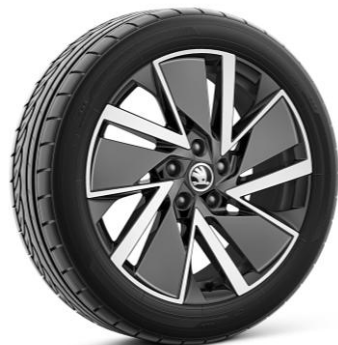
18" Vega aero alloy wheels (Code C8N)