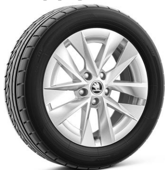
17" Rotare alloy wheels (Code C6U)