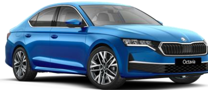
Race Blue (8X8X – Metallic)