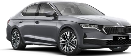
Graphite Grey (5X5X – Metallic)