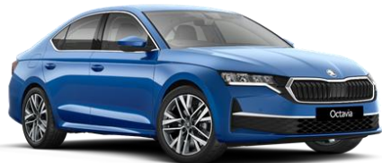
*Energy Blue (K4K4 – Solid)