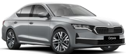
Smokey Diamond Silver (B3B3 – Metallic)