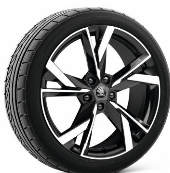
19" Draconis alloy wheels (Code PJN)