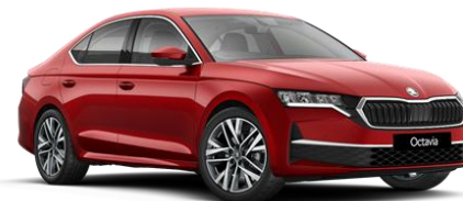
Velvet Red (K1K1 – Exclusive)