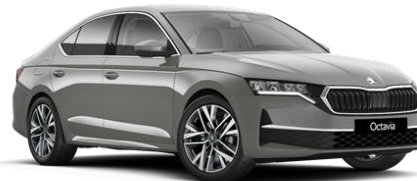
Steel Grey (M3M3 – Solid)