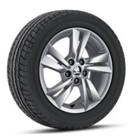
15" 'Cygnus' alloy wheels (Code PJI)