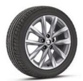
16" 'Vigo' alloy wheels (Code PJJ)