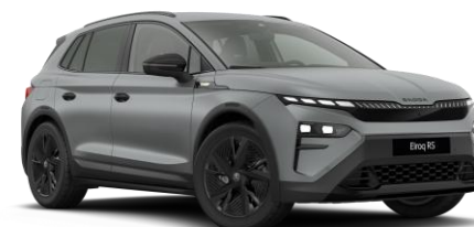
Graphite Matt Grey (O3O3 - Exclusive)