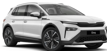
Moon White (2Y2Y – Metallic)