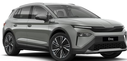
Steel Grey (M3M3 – Solid)