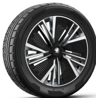
20" 'Neptune' alloy wheels (Code 56H)