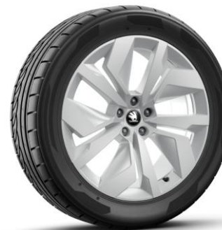
20" 'Vega' alloy wheels (Code PJE)