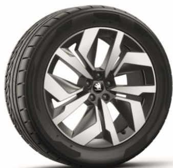
20" 'Vega' alloy wheels (Code 65Q)