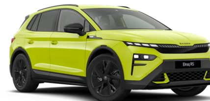
Mamba Green (1313 – Solid)