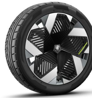
21" 'Vision' alloy wheels (Code PJQ)