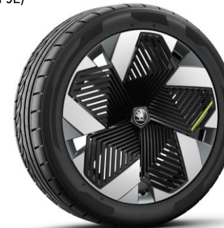
21" 'Vision' alloy wheels (Code PJQ)