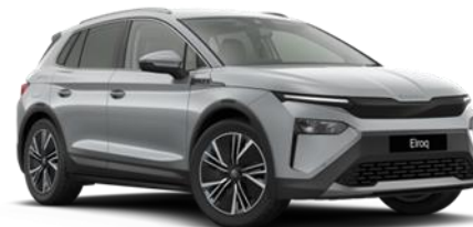
Smokey Diamond Silver (B3B3– Metallic)