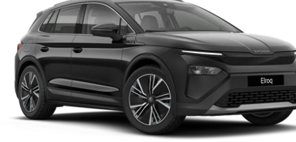
Black Magic (1Z1Z – Metallic)