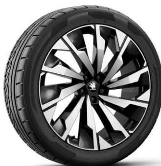
21" 'Supernova' alloy wheels (Code PJP)