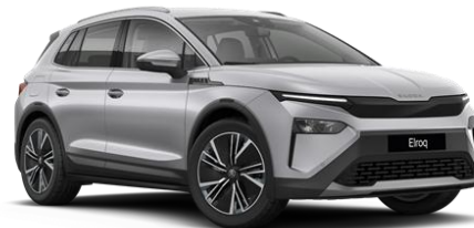
Brilliant Silver (8E8E – Metallic)