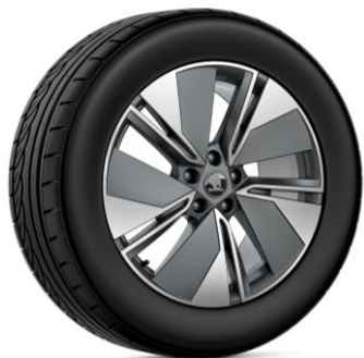
19" 'Regulus' alloy wheels (Code PJB)