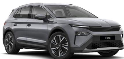
Graphite Grey (5X5X – Metallic)