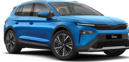
Race Blue (8X8X – Metallic)