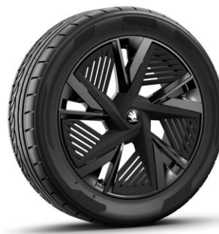
20" 'Draconis' alloy wheels (Code 55K)