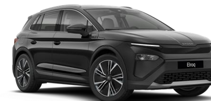
Black Magic (1Z1Z - Metallic)