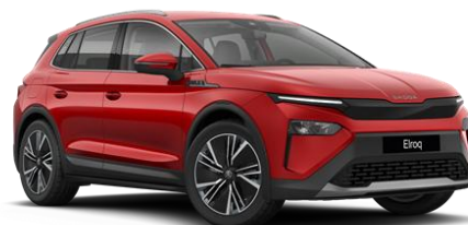
Velvet Red (K1K1 – Exclusive)