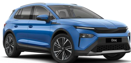
Energy Blue (K4K4 – Solid)