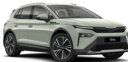
Timiano Green (0B0B – Solid)