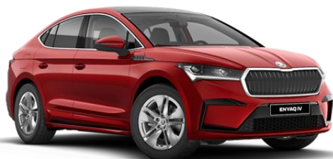
Velvet Red (K1K1 – Exclusive)