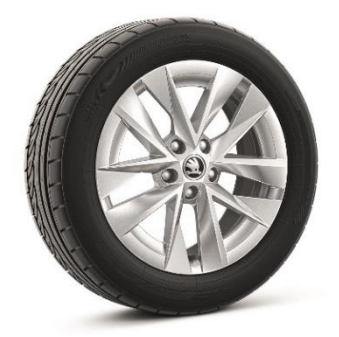
17" 'Rotare' alloy wheels (Code PX2)