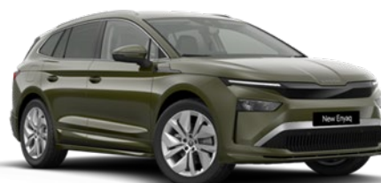
Olibo Green (R2R2 – Exclusive)