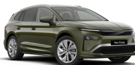
Olibo Green (R2R2 – Exclusive)