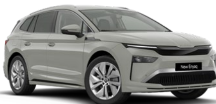
Steel Grey (M3M3 – Solid)