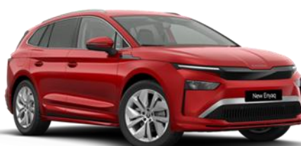
Velvet Red (K1K1 – Exclusive)