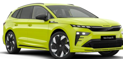
Mamba Green (I3I3 – Solid)*