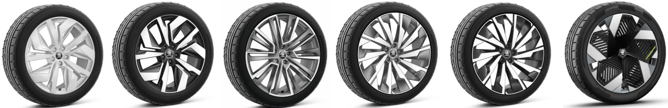
20" 'Vega' silver alloy wheels (Code U20/65R) 20" 'Vega' anthracite alloy wheels (Code CB2) 21" 'Aquarius' anthracite alloy wheels (Code C5W) 21" 'Supernova' anthracite alloy wheels (Code PJG/PJH) 21" 'Supernova' black alloy wheels (Code PJJ/PJM) 21" 'Vision' alloy wheels (Code 65Z)