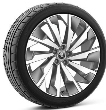
21" 'Supernova' anthracite alloy wheels (Code PJH)