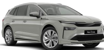
Steel Grey (M3M3 – Solid)