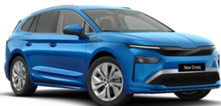
Race Blue (8X8X – Metallic)