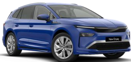
Energy Blue (K4K4 – Solid)