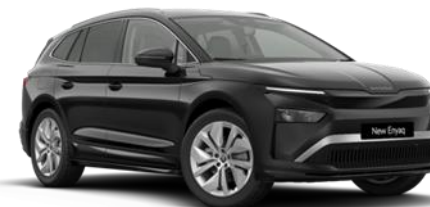
Black Magic (1Z1Z – Metallic)