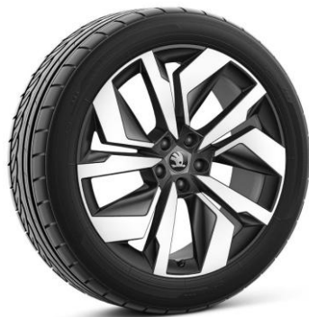
20" 'Vega' anthracite alloy wheels (Code 65Q)