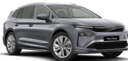
Graphite Grey (5X5X – Metallic)