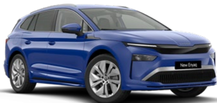
Energy Blue (K4K4 – Solid)