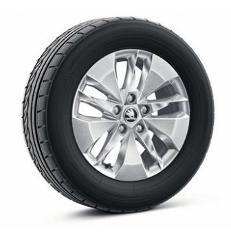
16" 'Twister' alloy wheels (Code PJO)