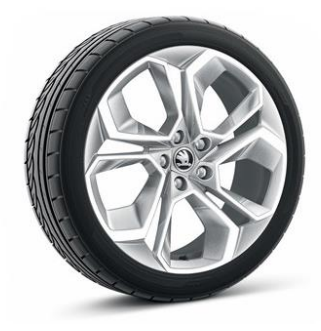
19" 'Altair Silver' alloy wheels (Code PJK)