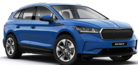
Energy Blue (K4K4 – Solid)