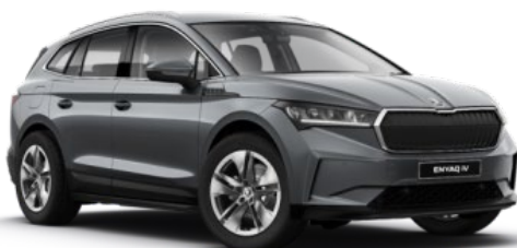
^Graphite Grey (5X5X – Metallic)