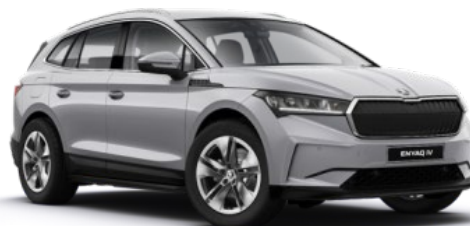
Brilliant Silver (8E8E – Metallic)