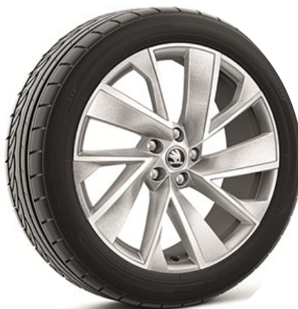
20" 'Vega' alloy wheels (Code PJG / PJH)