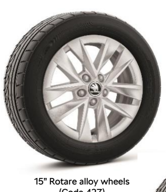
15" Rotare alloy wheels (Code 42Z)