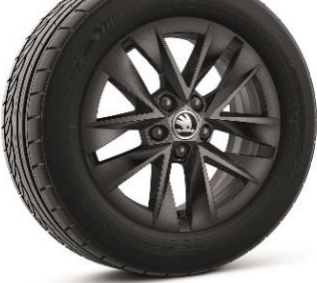
15" Rotare black alloy wheels (Code PJ3)