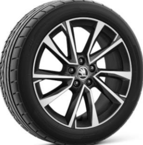
17" Procyon black & diamond cut alloy wheels (Code PJE)