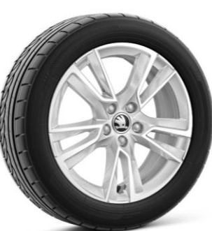
16" Proxima silver alloy wheels (Code PJ4)