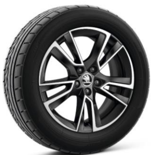
16" Proxima black & diamond cut alloy wheels (Code CI8)