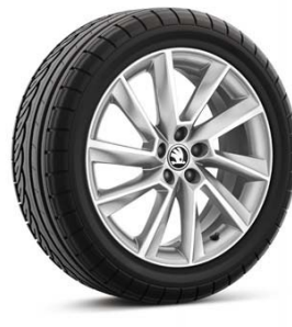
17" 'Stratos' alloy wheels (Code 45H)