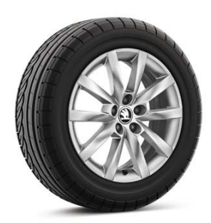
16" 'Alaris' alloy wheels (Code P04)