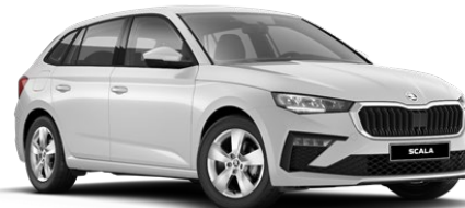
Moon White (2Y2Y – Metallic)