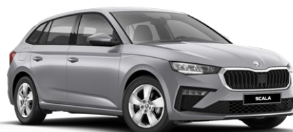
Brilliant Silver (8E8E – Metallic)