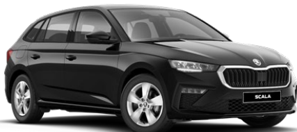
Black Magic (1Z1Z – Metallic)