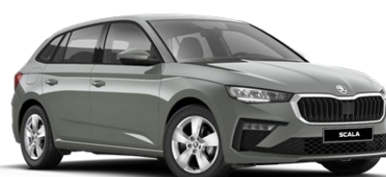
Steel Grey (M3M3 – Solid)