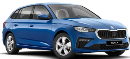
Energy Blue (K4K4 – Solid)