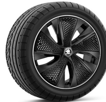
17" Kajam alloy wheel with aero cover (Code 41B)