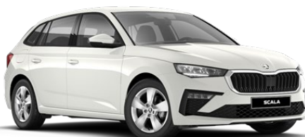
Candy White (9P9P – Solid)