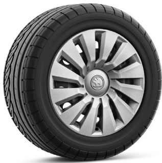
16" Tecton steel wheels (Code CY0)