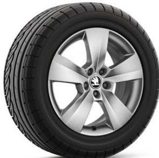
16" Nyota alloy wheels (Code CF1)