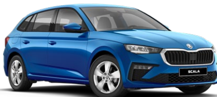
Race Blue (8X8X – Metallic)