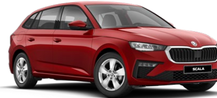
Velvet Red (K1K1 – Exclusive)