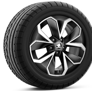
16" Montado Aero alloy wheels (Code P08)