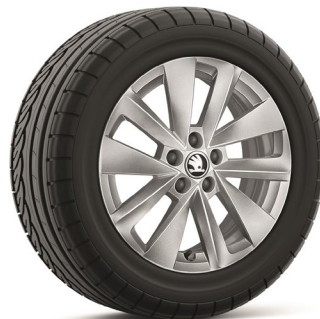
16" Cortadero Aero alloy wheels (Code P02)