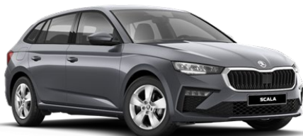
Graphite Grey (5X5X – Metallic)