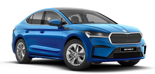
Race Blue (8X8X - Metallic)