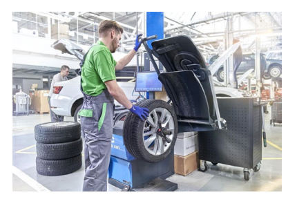
4 Low Rolling Resistance Tyres provide better battery range and low cabin noise levels. They are likely to be the most expensive operating cost you will experience during the lifetime of the vehicle.