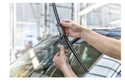
Wiper Blades ensure maximum visibility and safety. A set of wiper blades is included in the Tyre & Maintenance Plan.

Tyre and Maintenance Plan Summary: Replacement Tyres - As required €1,240, Mode 2 Charging Cable for backup/domestic charging (supplied at delivery) -€274, Inspection 1 & 2 - Electronic Vehicle Health Check, Functionality and Fault Assessment -€70, Routine Service Maintenance - High Voltage Component Check, Running Gear Assessment, High Voltage Battery Status, Brake Fluid Change, Pollen Filter Replacement, Top-up Cooling System Levels- €209, Brake Pad Replacement - As required-€175, Wiper Blade Replacement - As required -€96. Total value if purchased separately €2,064. As part of Tyre and Maintenance Plan €1,250 (saving of 39%). Price based on component recommended retail price and average dealer labour rates. Tyre prices are based on 21" Self Sealing Technology. Please discuss your Tyre & Maintenance Plan requirements with your local ŠKODA Dealer.