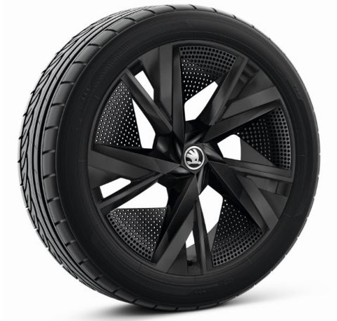
20" 'Taurus' black metallic alloy wheels (Code 55K)