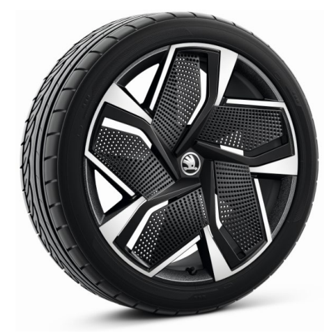
21" 'Vision' anthracite alloy wheels (Code PJS)