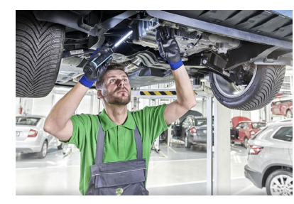
Service Interval Maintenance High voltage component checks, Brake Fluid Change, Pollen Filter Replacement and a Coolant refill are the main tasks carried out by technicians during this service.