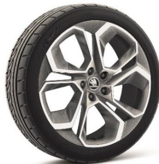
19" 'Altair Anthracite' alloy wheels (Code PJL)