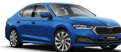
Race Blue (8X8X – Metallic)