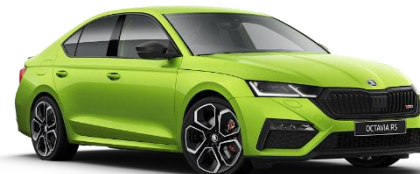
^Mamba Green (I3I3 – Solid)