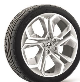
19" 'Altair Silver' alloy wheels (Code PJK)