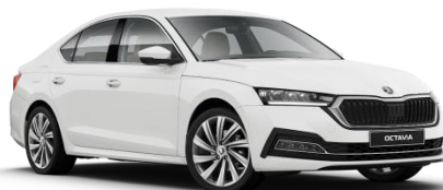
Moon White (2Y2Y – Metallic)