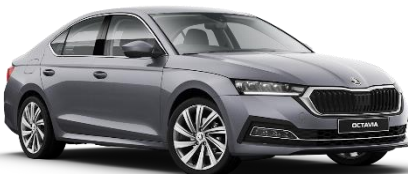
Graphite Grey (5X5X – Metallic)