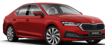
Velvet Red (K1K1 – Exclusive)