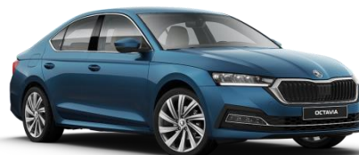
*Lava Blue (0F0F – Metallic)