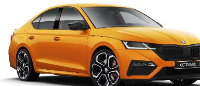
Phoenix Orange (2X2X – Exclusive)