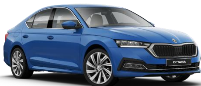
*Energy Blue (K4K4 – Solid)