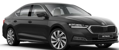
Black Magic (1Z1Z – Metallic)