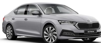
Brilliant Silver (8E8E – Metallic)