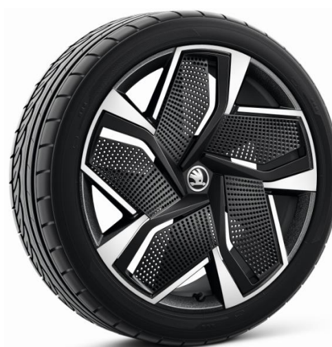
21" 'Vision' anthracite alloy wheels (Code PJS)