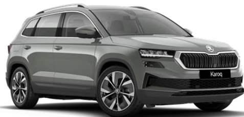
Steel Grey (M3M3 – Solid)