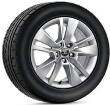
17" Scutus silver alloy (Code U47)