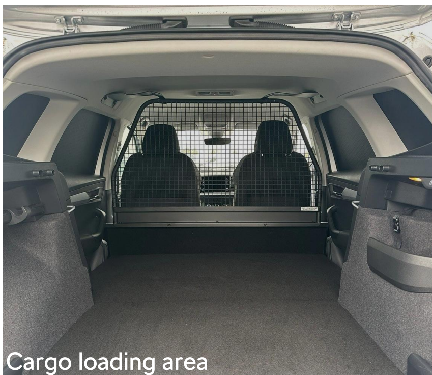
Cargo loading area