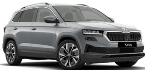
Smokey Diamond Silver (B3B3 – Metallic)