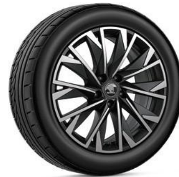
18" Hydrus black alloy (Code F04)