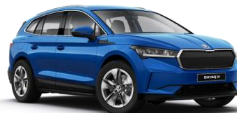
Race Blue (8X8X – Metallic)