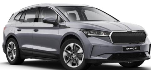
Graphite Grey (5X5X – Metallic)