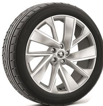
20" 'Vega' alloy wheels (Code PJG / PJH)