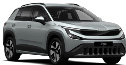
Pebble Silver (F0F0 – Metallic)