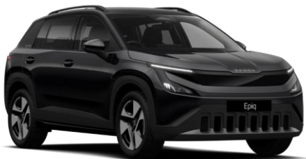
Mystery Black (2T2T – Metallic)