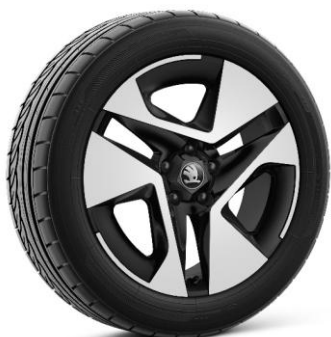
18" 'Saola' alloy wheels (Code U42)