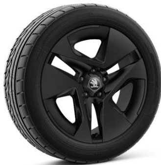
18" 'Plover' alloy wheels (Code PJ1)