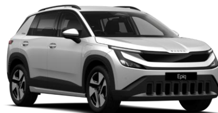
Platinum White (3L3L – Metallic)