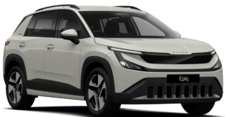
Marble Grey (6U6U – Solid)