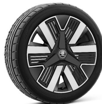
19" 'Lark' alloy wheels (Code PJ3)