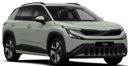
Timiano Green (0B0B – Solid)