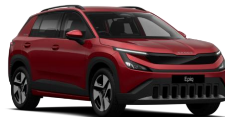
Jasper Red (P8P8 – Exclusive)