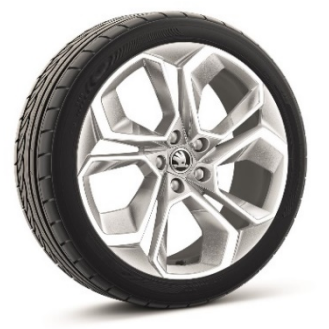
19" 'Altair Silver' alloy wheels (Code PJK)