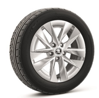
17" 'Rotare' alloy wheels (Code PX2)