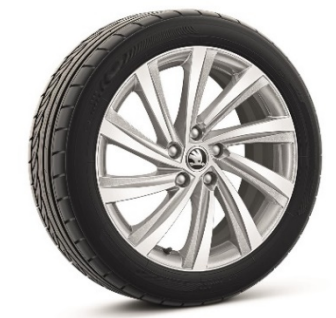
18" 'Perseus' alloy wheels (Code PJ5)