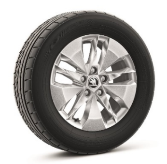
16" 'Twister' alloy wheels (Code PJ0)