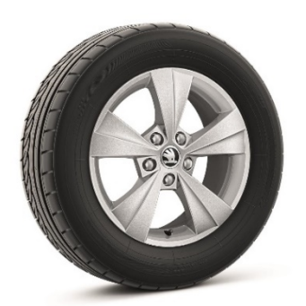
16" 'Velorum' alloy wheels (Code PJ1)