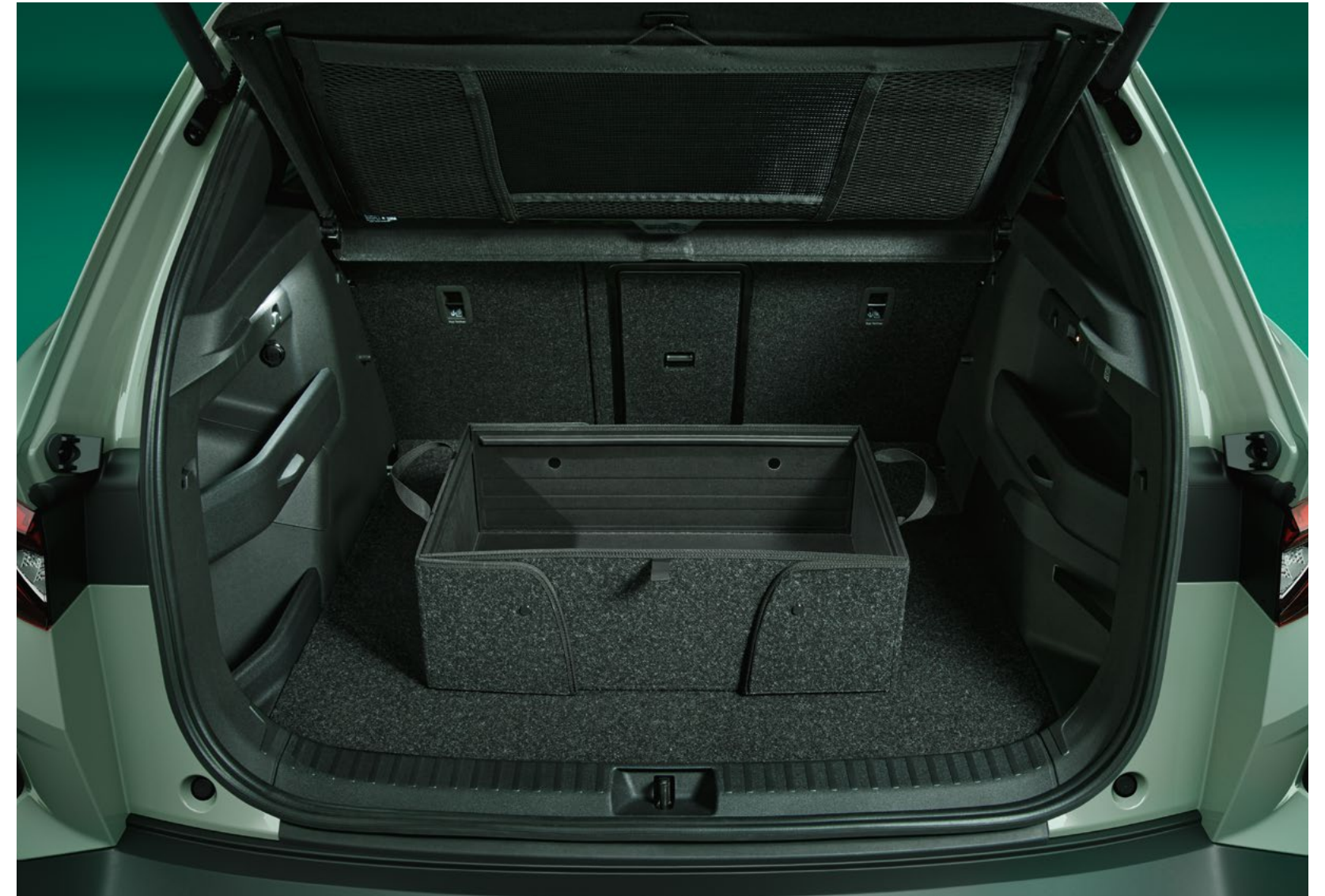
Double-sided boot mat – crate*