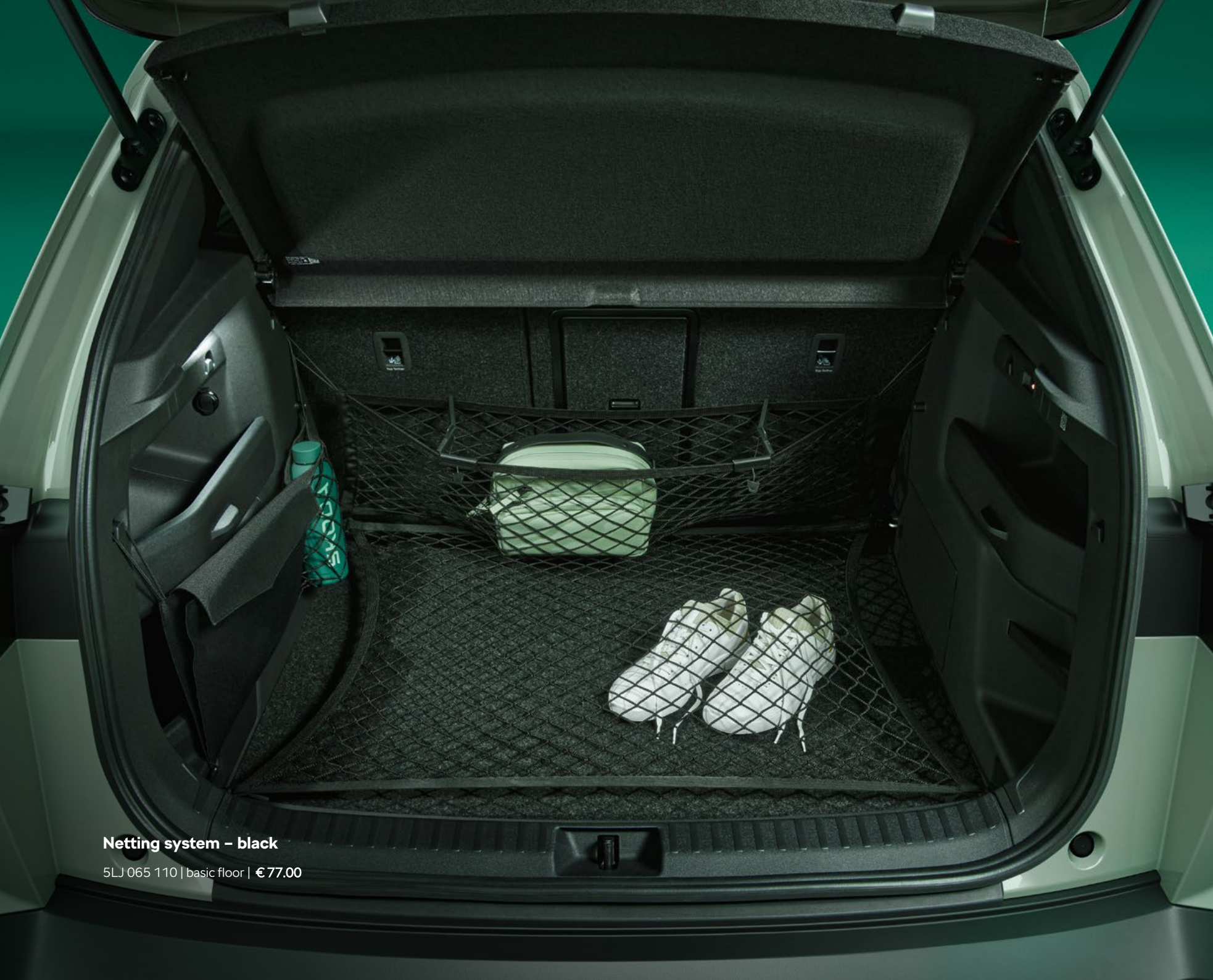
Netting system – black