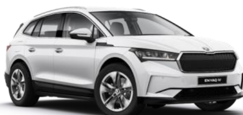
Moon White (2Y2Y – Metallic)