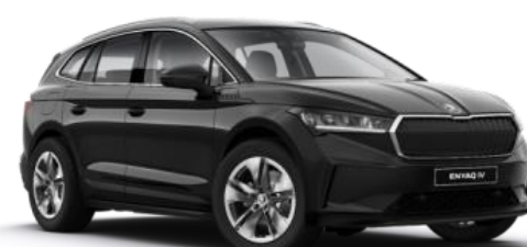
Black Magic (1Z1Z – Metallic)