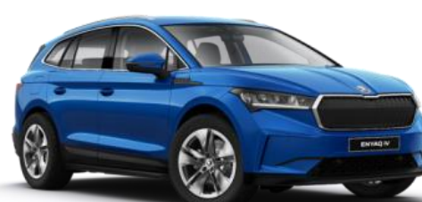
Race Blue (8X8X – Metallic)