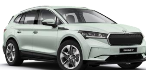
Artic Silver (H6H6 – Metallic)