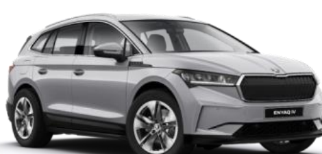
Brilliant Silver (8E8E – Metallic)