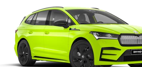
*Mamba Green (I3I3 – Solid)