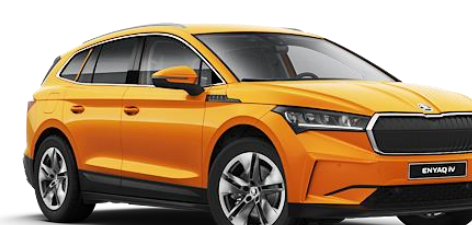
Phoenix Orange (2X2X – Exclusive)