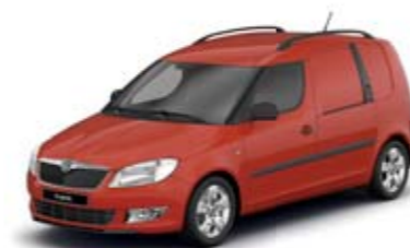
Corrida Red uni