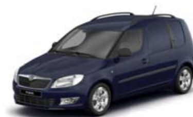
Pacific Blue uni