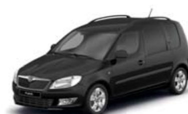
Black Magic pearl effect