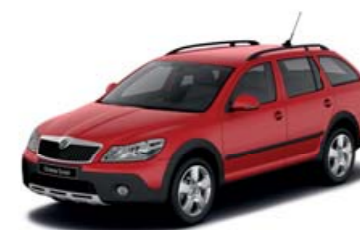
Corrida Red uni