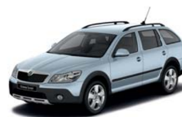
Aqua Blue metallic