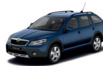
Storm Blue metallic