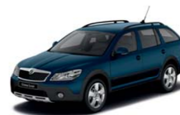
Pacific Blue uni