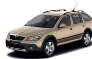
Safari Beige metallic