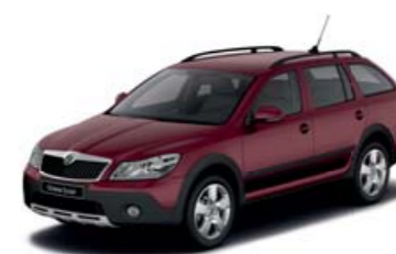
Rosso Brunello metallic