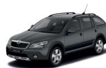
Anthracite Grey metallic