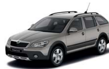
Cappuccino Beige metallic