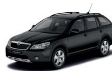
Black Magic pearl effect