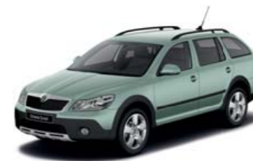
Arctic Green metallic