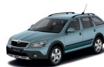
Satin Grey metallic