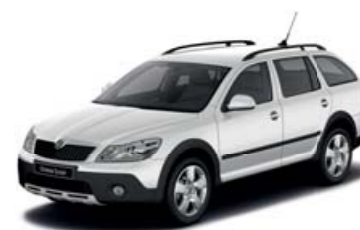
Candy White uni